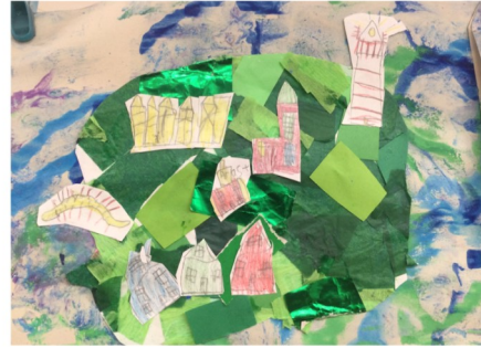
Our Imaginary Islands

We have explored sewing and weaving which are part of Highland life.