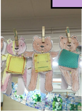
Sewing up Tiresome Ted

In KS1 we have been learning all about Island life using the 'Katie Morag' stories.